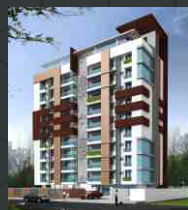
RidhiRaj Avenue Near Amrapali Circle, Vaishali Nagar, Jaipur