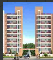
RidhiRaj Residency Vijay Path, Tilak Nagar, Jaipur