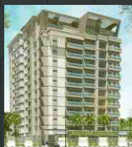
The Park Central Opp. Central Park Tonk Road, Jaipur