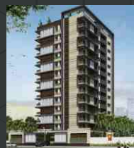
Aralyas Opp. Pink Square Mall Govind Marg, Jaipur