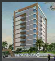
Bungalow 8 Near Rambagh Circle Bapu Nagar, Jaipur