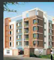
RidhiRaj Envlave Hanuman Nagar-D, Vaishali Nagar, Jaipur