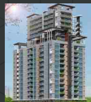
AIR Opposite Shyam Nagar, Main Ajmer Road, Jaipur

Disclaimer:- This brochure is for illustrative purpose only and it can not be in anyway treated as legal document.